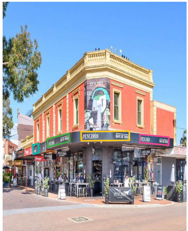
Awning fascia sign calculation