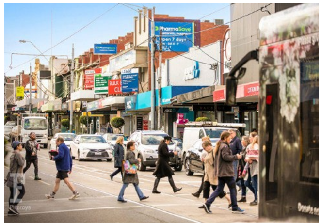
Adhoc and inconsistent advertising sign additions contribute to sign proliferation and reduce visual amenity.

7.5 Advertising signs do not protrude over Council property, including footpaths unless approval has been granted under the provisions of the Local Government Property Local Law 2008 .