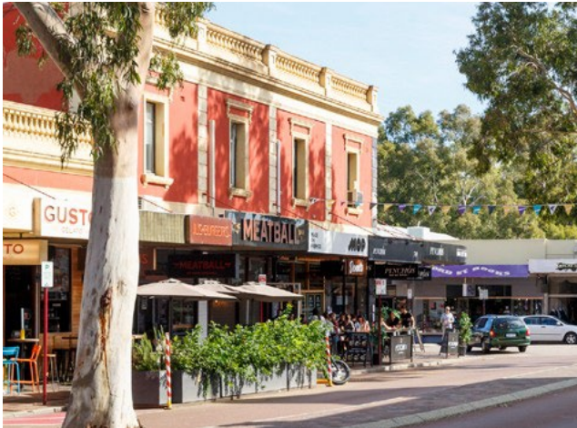
Acknowledging the local context produces a uniform and consistent series of advertising sign opportunities.