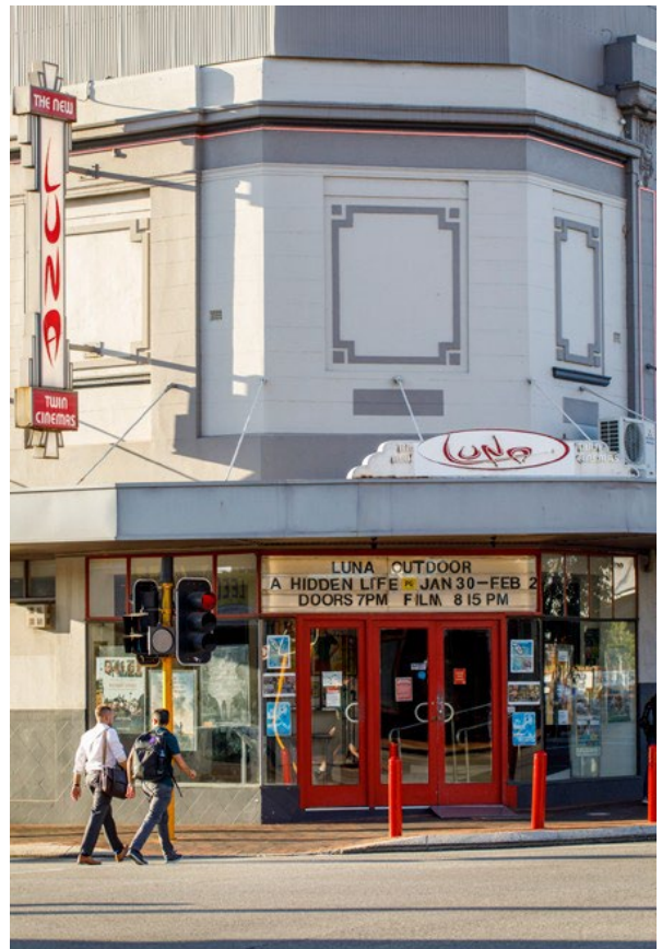
Signage does not detract from or obscure the significant elements of the heritage place.