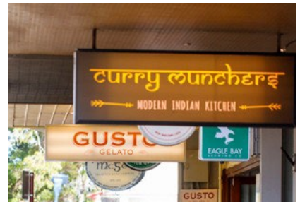
Illuminated below awning sign