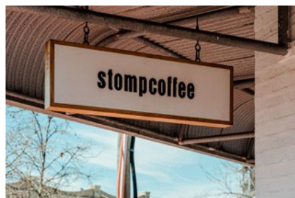
Below awning sign