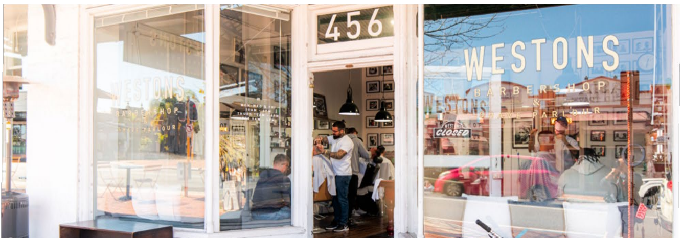
Advertising signs should maintain active frontages and visual surveillance into and out of the business.