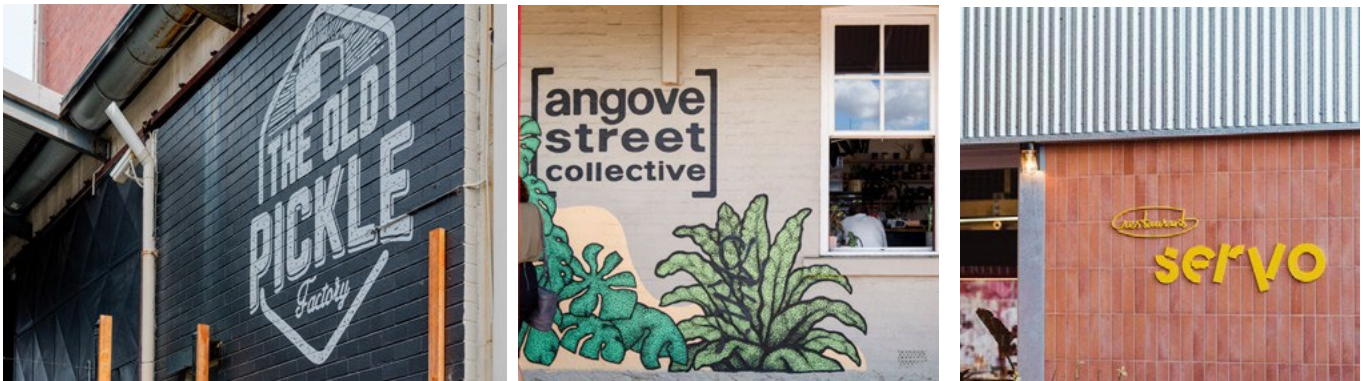
Wall signs can add visual interest when creatively designed or incorporated into the design of the building.