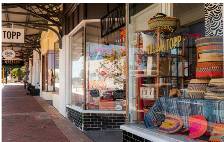
Windows free of excessive signage maintains active frontages and visual surveillance.