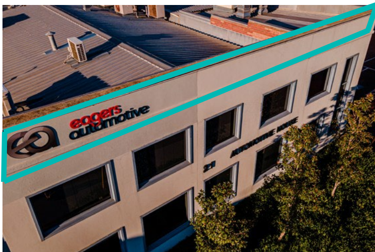
Roof signs are affixed parallel to the fascia but do not project above the roof line.