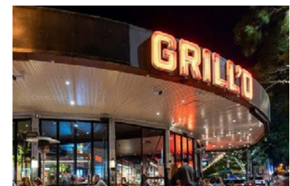
Illuminated awning fascia sign