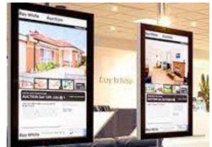
Digital window sign