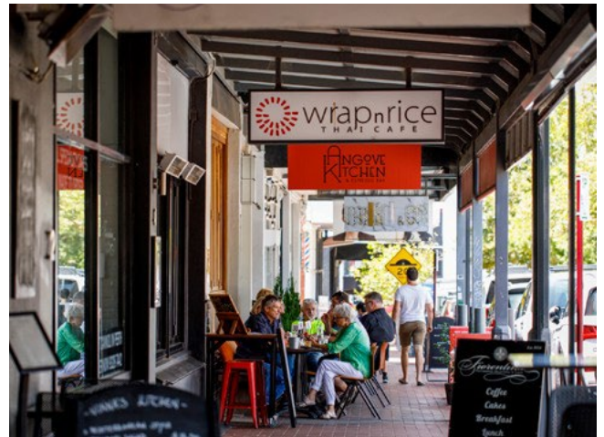
Consistency of signage location and scale provides continuity to the streetscape at pedestrian level.

7.3 A maximum of four (4) different sign types in accordance with Clause 10 for sites in non-residential zones, and a maximum as per Clause 9 for sites in the Residential zone.