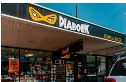
Below awning sign