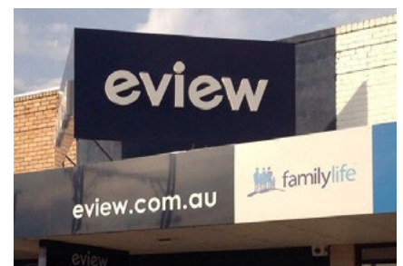
Above awning sign