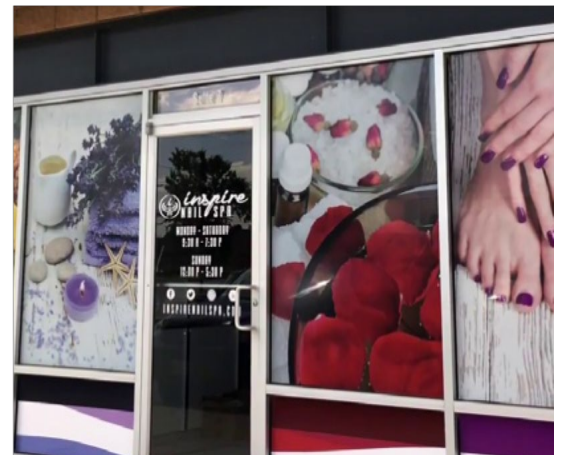
Excessive window coverage that reduces active frontages will generally not be permitted.