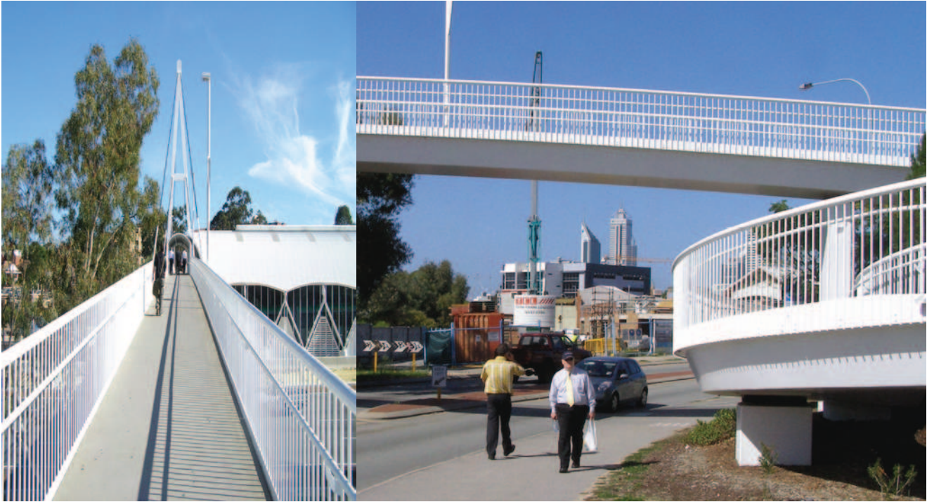
TRAIN STATION RADIUS