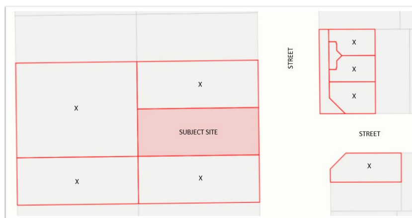
Figure 1 – Example of the extent of consultation to adjacent properties where there are varying lot layouts.