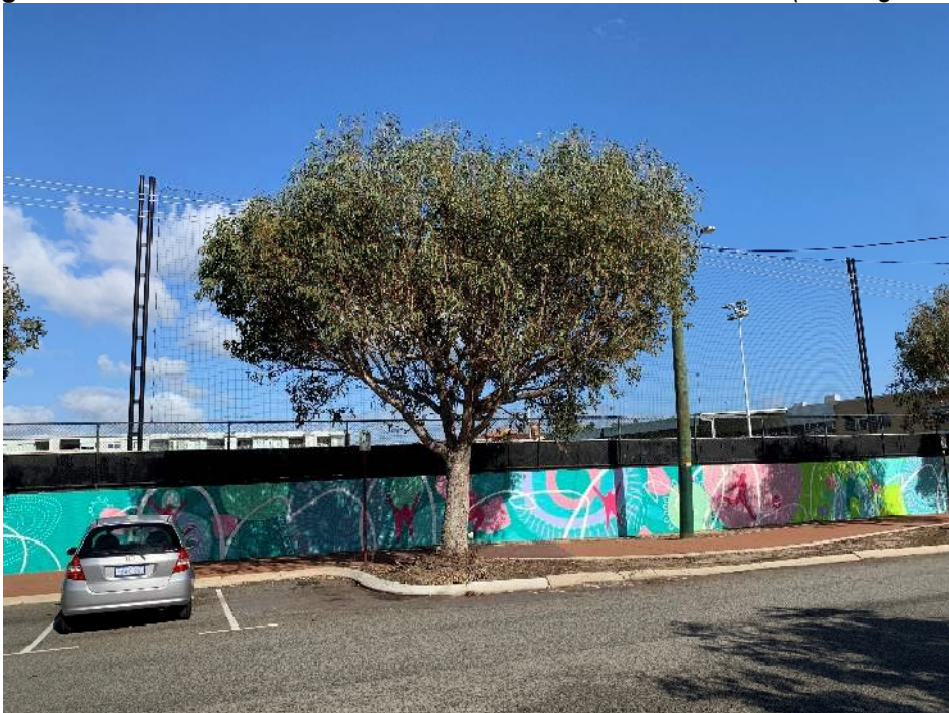
Figure 2 – View of the Soccer Net Structure from Lawley Street (Looking South).