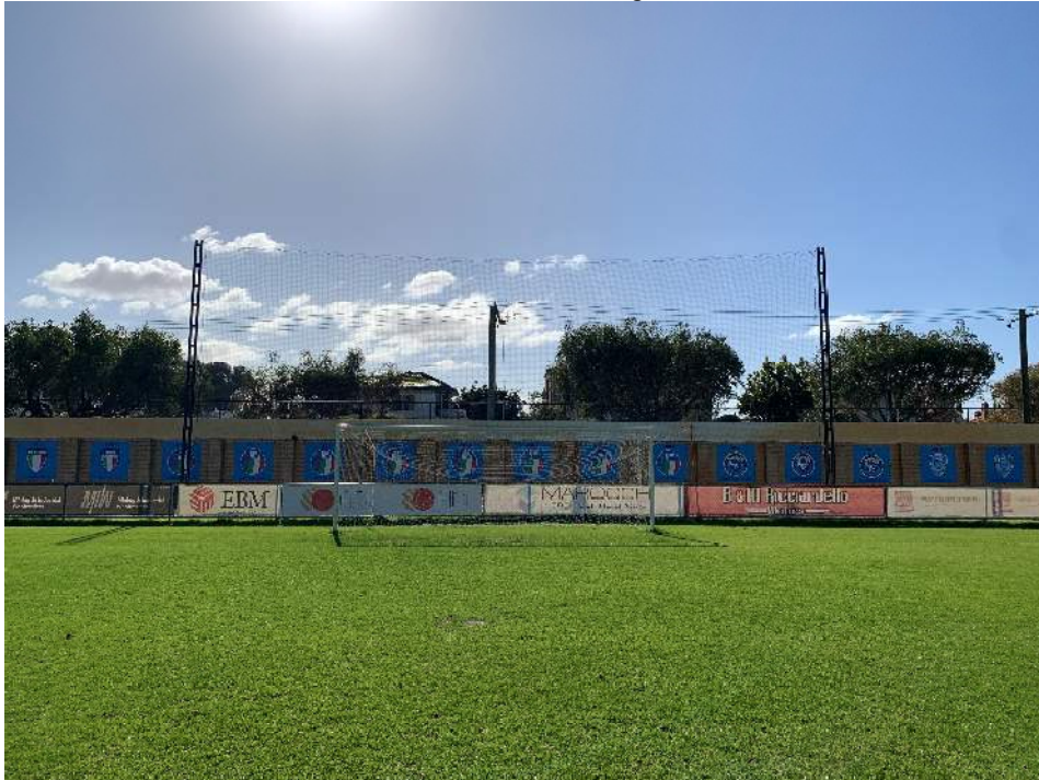
Figure 1 – View of the Soccer Net Structure from Perth Soccer Club (Looking North).

The works are unauthorised existing development as the structure was installed between February and April of 2023 with no valid development approval. The structure is not exempt under the Planning and Development (Local Planning Schemes) Regulations 2015 or the City's Local Planning Policy: Planning Exemptions . The constructed structure is shown in the below Figures.